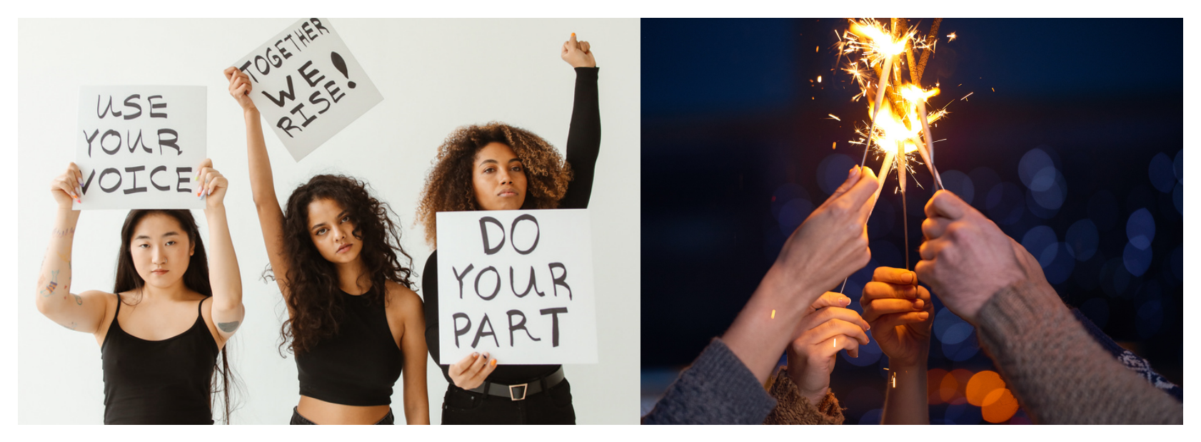
This document was prepared in Canva and makes useof freely-usable images.

Woll, B. & Li, W. (2019) Cognitive benefits of language learning: Broadening our perspectives. Final Report to the British Academy. www.thebritishacademy.ac.uk/publications/cognitive-benefits-language-learning-perspectives-report/